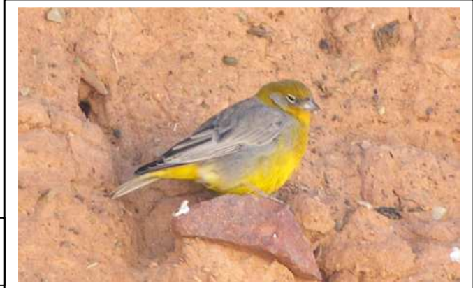
Bright-rumped Yellow Finch & Burrowing Owl

We spent a week in Argentina this year where Seriema Nature Tours took us on a tour through the Andes of the north-west of the country. Our Guide, Hector Slongo, picked us up at Tucuman Airport and in a couple of hours we were high in the cloud forest looking at special birds like the Torrent Duck and Rufous-throated Dipper.