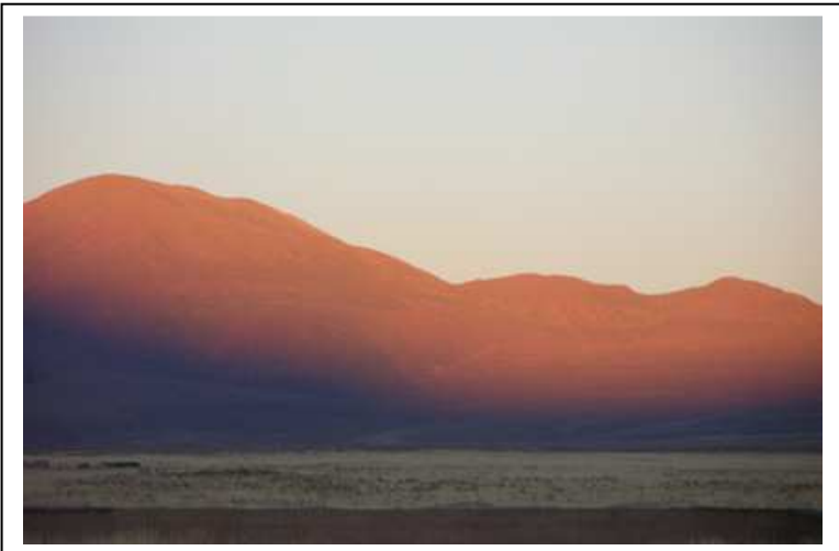
Sunset at Humahuaca Gorge

On the last day we were by the high Andean lakes at over 4,000 metres, here we found 3 species of Flamingos - Chilean, Andean & Puna; also Andean Avocet, Mountain Caracara and a selection of high altitude finches.