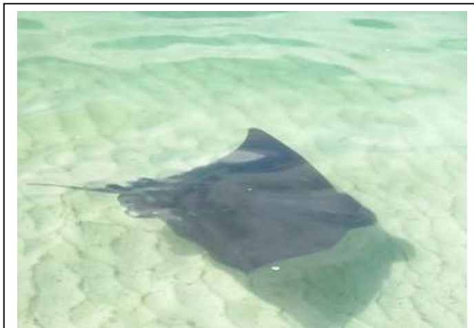
Eagle Ray, Parengarenga