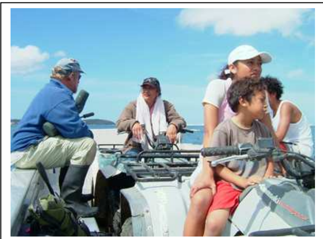
Wader mist-netting week