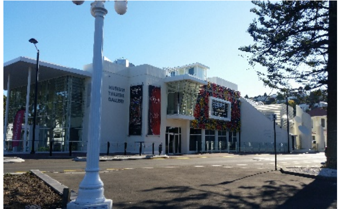
Napier's Museum Theater Gallery

This year's Birds New Zealand annual conference took place in Napier, at the fantastic Museum Theatre Gallery. It was wonderful to see familiar faces and newcomers alike coming together for two days of talks on all things ornithological. Presenters ranged from university professors to voluntary enthusiasts to museum curators and everything in between. The seabird crowd were out in force, but forest birds and waders featured too. One thing common to all the talks was a real sense of passion and enthusiasm for avian research, and an emphasis on the importance of understanding more about New Zealand's