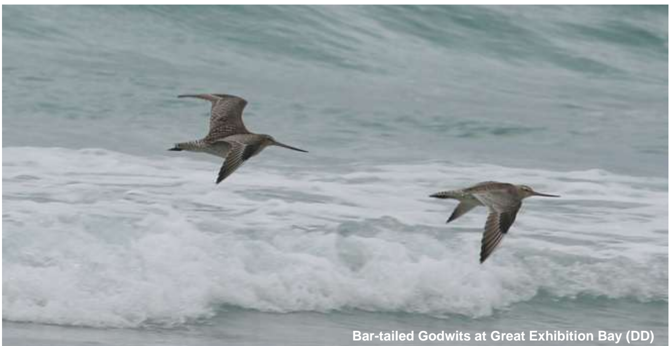
Bar-tailed Godwits at Great Exhibition Bay

I often circularise news by email such as programme changes, confirmation of times and meeting places of events, etc. If you do not have email, please give me a phone number so I can contact you with this information.