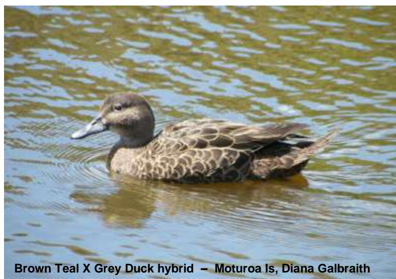
Brown Teal X Grey Duck hybrid - Moturoa Is, Diana Galbraith

Variable Oystercatcher - Many records and counts during Dotterel census. Evidence of breeding in many places including Otehei Bay, Urupukapuka Is, beach west of Waipiro Bay, Kowhai Beach, 5 pairs all with chicks on Motumaire Is (Paihia). Over 40 on Kokota Sandspit 13 Nov. Pied Oystercatchers in much lower numbers over the period.