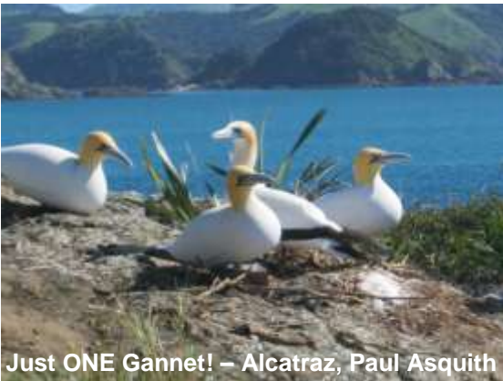
Just ONE Gannet! – Alcatraz