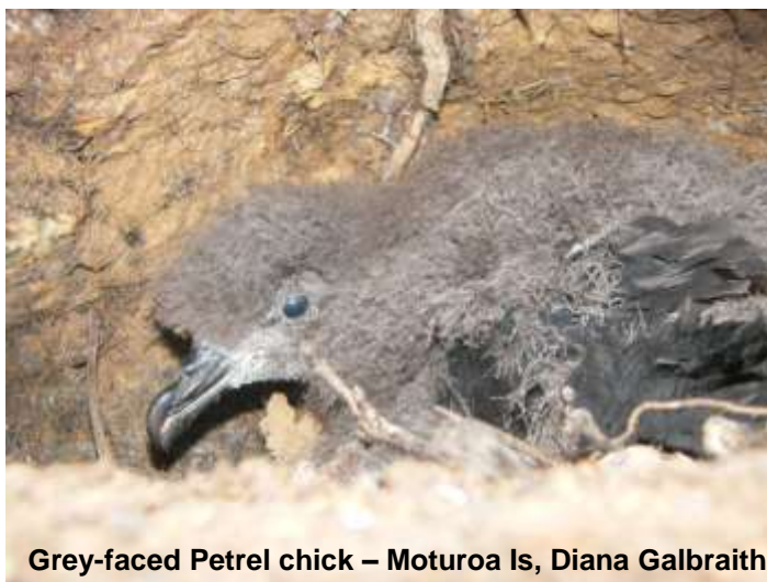
Grey-faced Petrel chick - Moturoa Is, Diana Galbraith

Brown Teal - Hybrid with Grey Duck on Moturoa Island.