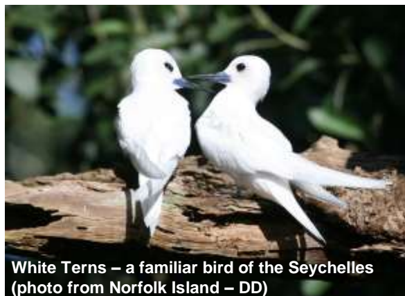
White Terns – a familiar bird of the Seychelles (photo from Norfolk Island – DD)

Many days this month were spent Dotterel-counting – see report on page 5.