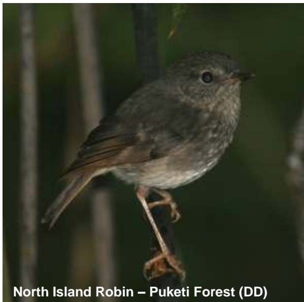
North Island Robin – Puketi Forest (DD)

North Island Robin 1, possibly 2 calling in Awa-awaroa Cove, Moturoa, 5 Dec (LMA), 3 on Moturoa Island 17 Dec (field trip).