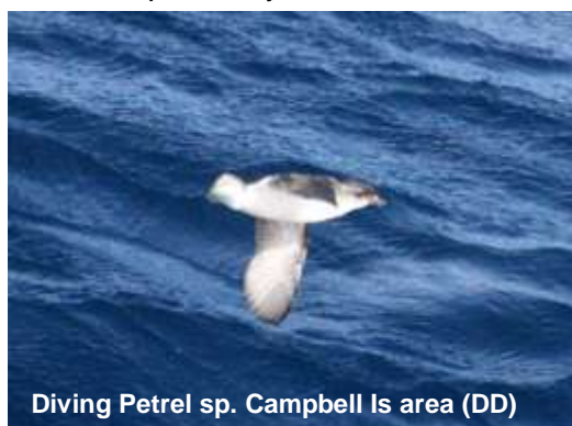
Diving Petrel sp. Campbell Is area (DD)

Also off Spirits Bay on 22 Oct: Flesh-footed Shearwater (c.20), Buller's Shearwater (c.10), Sooty Shearwater (c.20), Little Shearwater (1), Diving Petrel sp. (c.20)