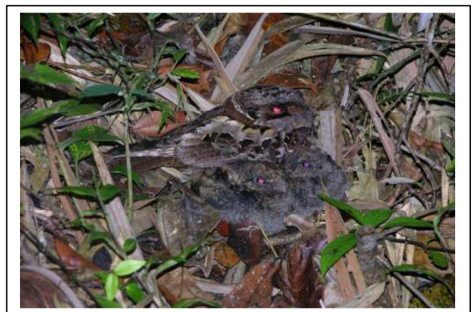
Collared Nightjar, Mantadia