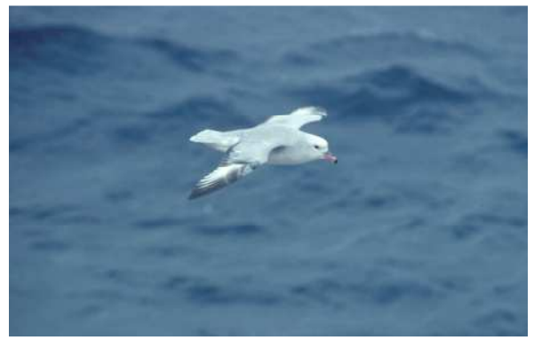
Antarctic Fulmar

Buller's Shearwater 2 Sooty Shearwater 5 Fluttering Shearwater 9 Little Shag 2 Southern Black-backed Gull 1