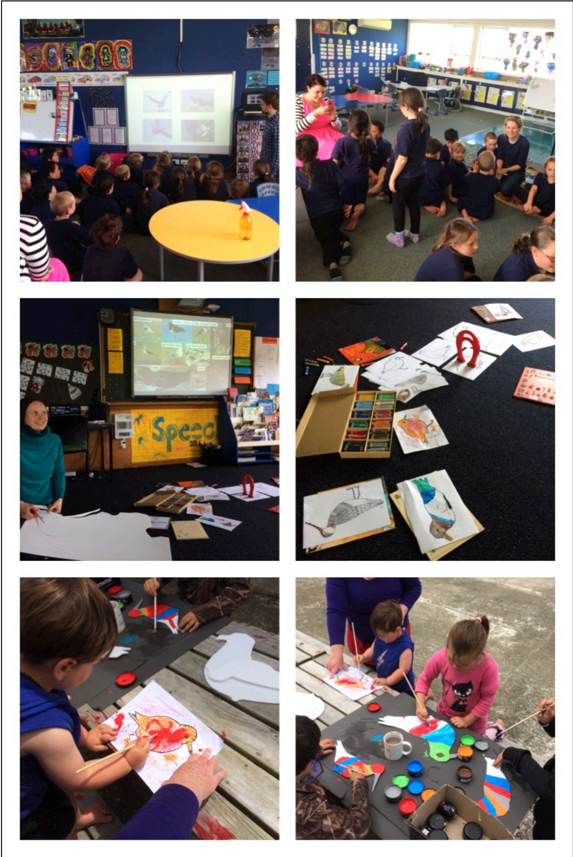
Figure 2. Workshops at TeOne and Pitt Island Primary Schools. Colours were kindly provided by Resene ColorShop.