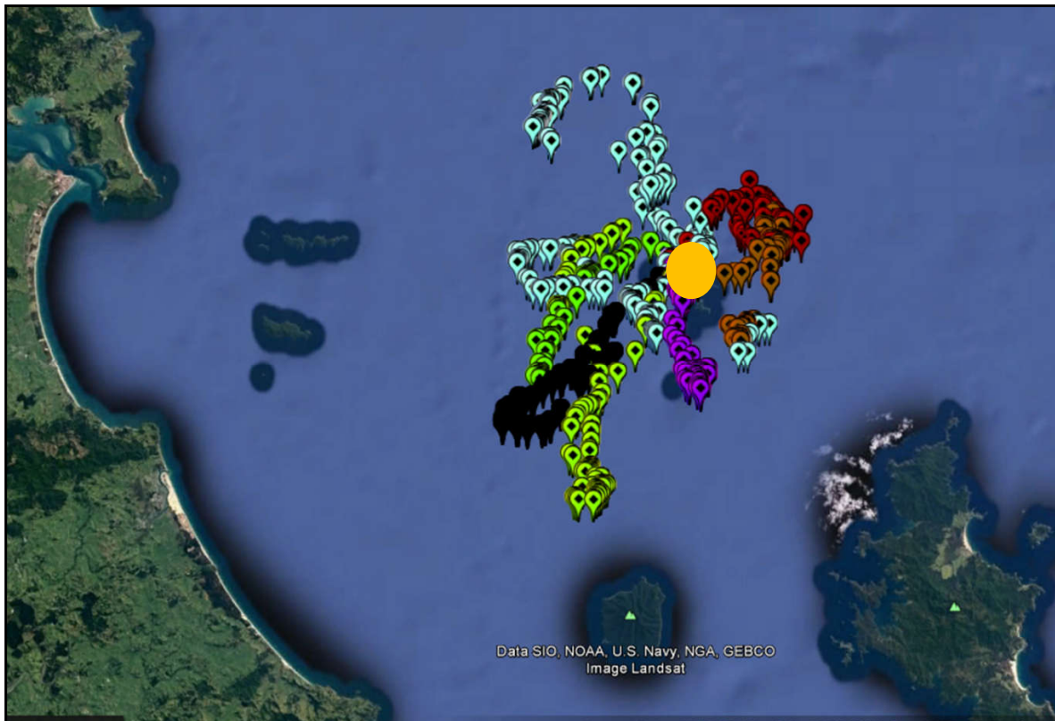
Figure 1: Preliminary GPD tracks of adult Diving petrels ( Pelecanoides urinatrix ) tracked from Mokohinau Islands during Oct 2016. Orange circle represents location of colony and n = 7 birds.

invest more energy into foraging and exhibiting higher levels of physiological stress (increased stress hormones) due to the effort involved.